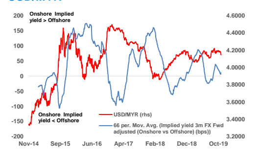
Chart 1 - Spreads - 3m Implied yield, Onshore FX FWD vs Offshore ) and USD/MYR

The other main driver we note for the Ringgit is the hedge cost where it's fetching 0.35% for a Dollar hedge trade. The 3m 25 Delta Risk Reversals vs the 3m ATM Implied Vol for USD/MYR is fetching at just under 0.5% and with the Dollar in a gradual trend lower, the cost of purchasing a Dollar call gets cheaper, since Dollar spot will be deemed a lot more cheap entry as an alternative. The cheaper Dollar hedge cost, gives the Ringgit more upside on a total return basis, (adjusted for hedge cost and inflation), thus further driving the idea that the Ringgit is gaining traction as a positive carry in the region (see chart 2).